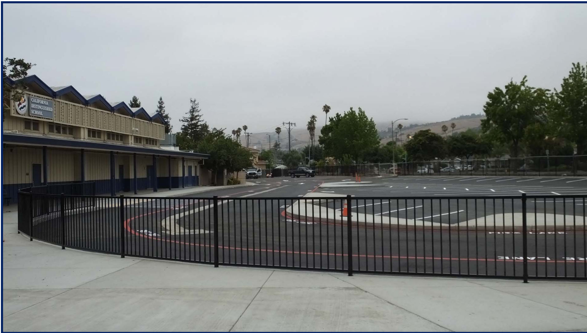
Piedmont Parking Lot