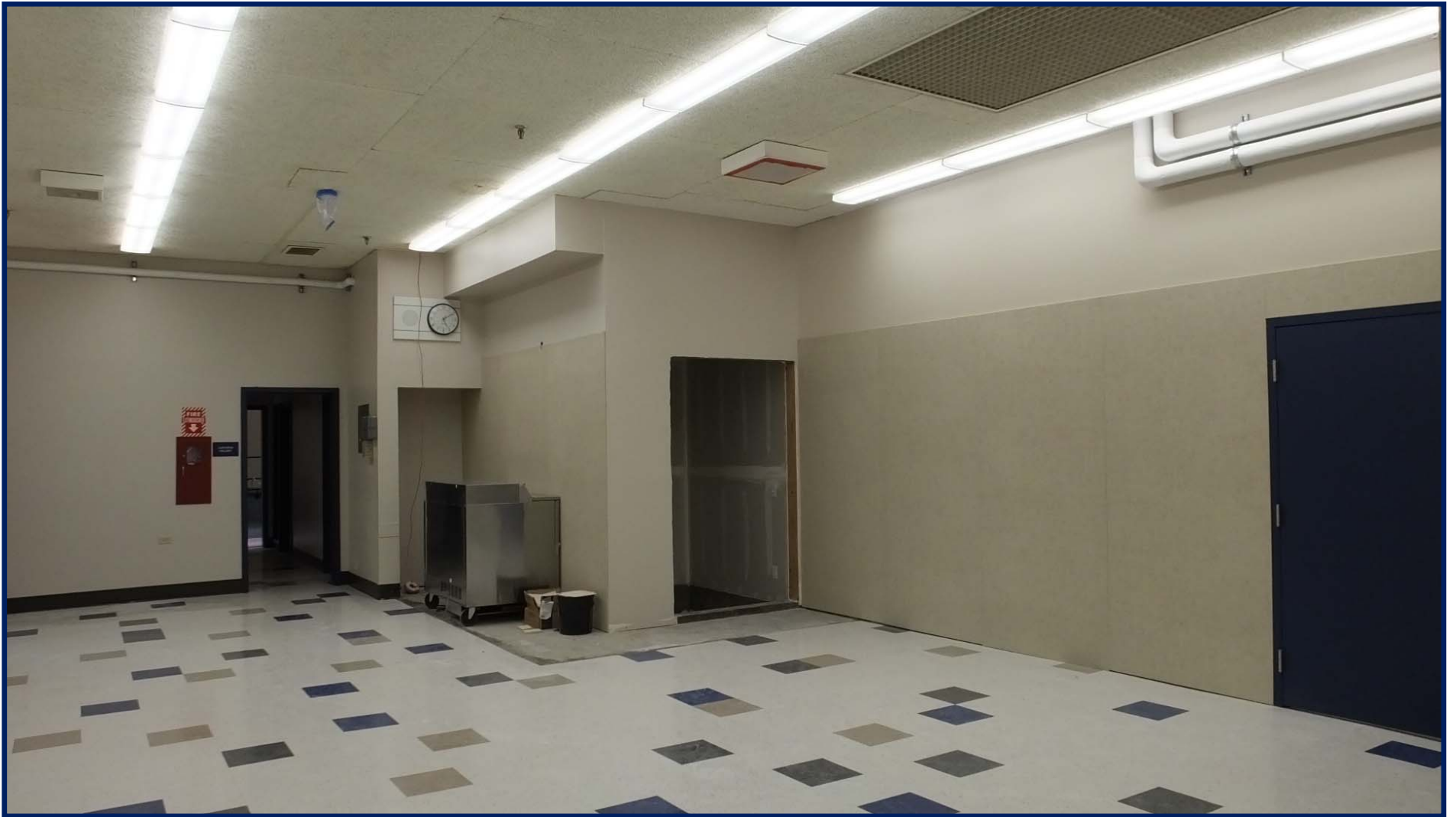
Cherrywood FIS – Kitchen Area - August