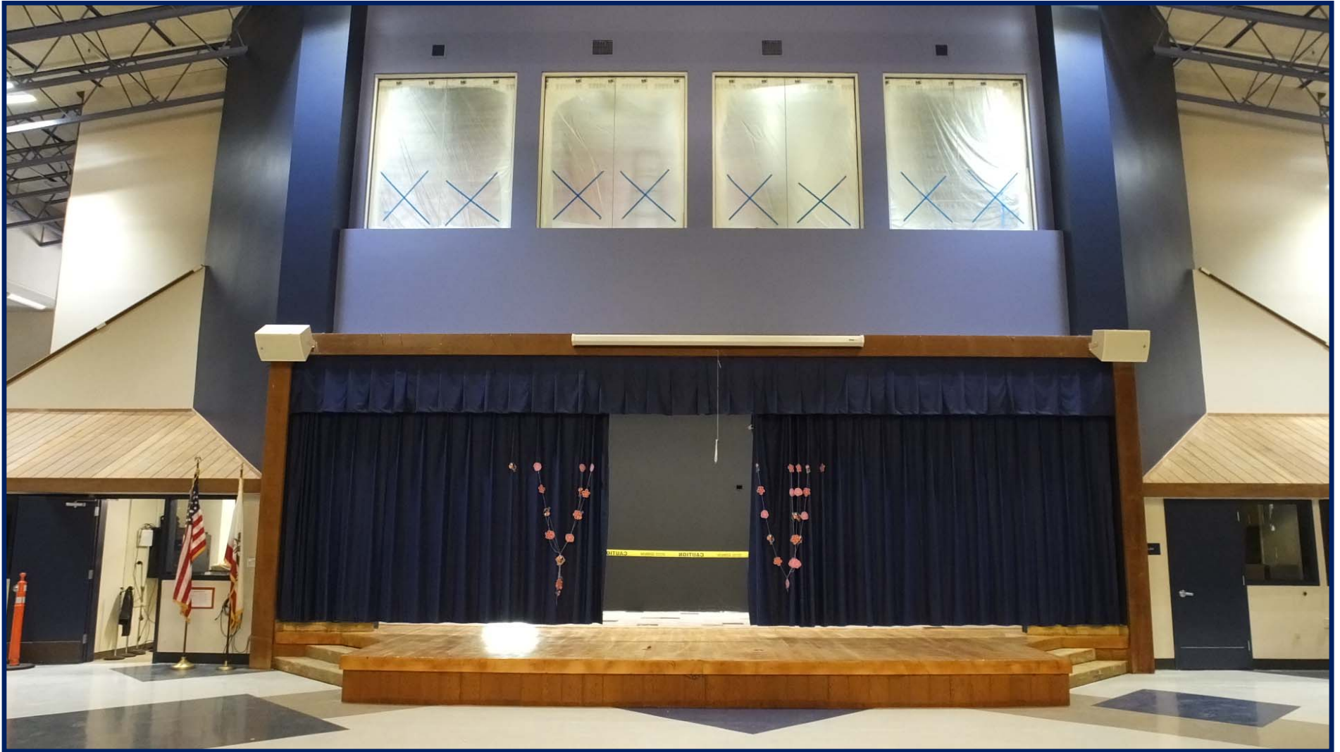
Cherrywood FIS – FIS Space Looking Up at FIS